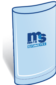
Bottom seal round (BNR) Width: 200 – 700 mm Length: 200 – 1200 mm