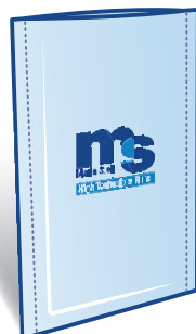
Side seal (SN) Width: 120 – 800 mm Length: 200 – 700 mm