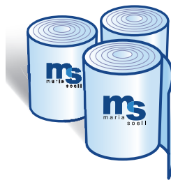
Rollstock Width: 200 – 700 mm